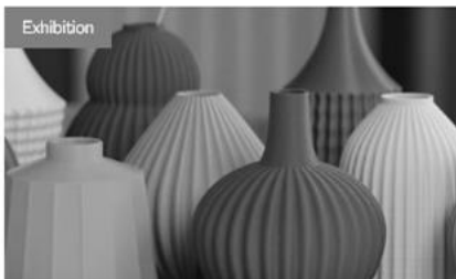
Handmade for Christmas 2023

Millennium Gallery Sat 21 October - Sun 24 December 2023