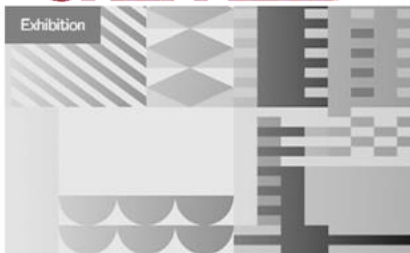
Pioneers: John Ruskin, William Morris and the Bauhaus

Millennium Gallery Sat 21 October - Sun 24 December 2023