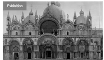
The Ruskin Collection: Comes the Flood

Millennium Gallery Thu 19 October 2023 - Sun 21 January 2024