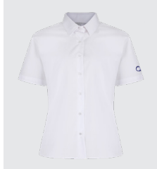
Twin Pack Shirt or Blouses