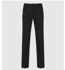
Trousers or Skirt